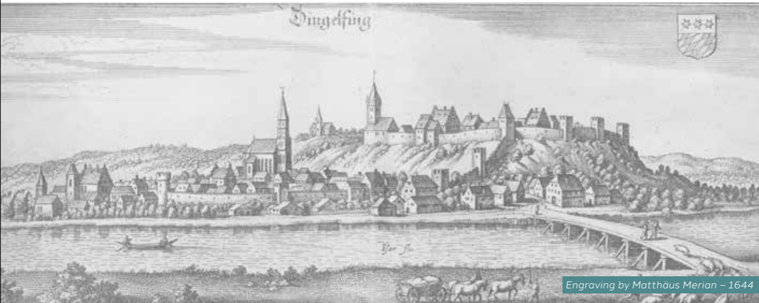
Engraving by Matthäus Merian – 1644