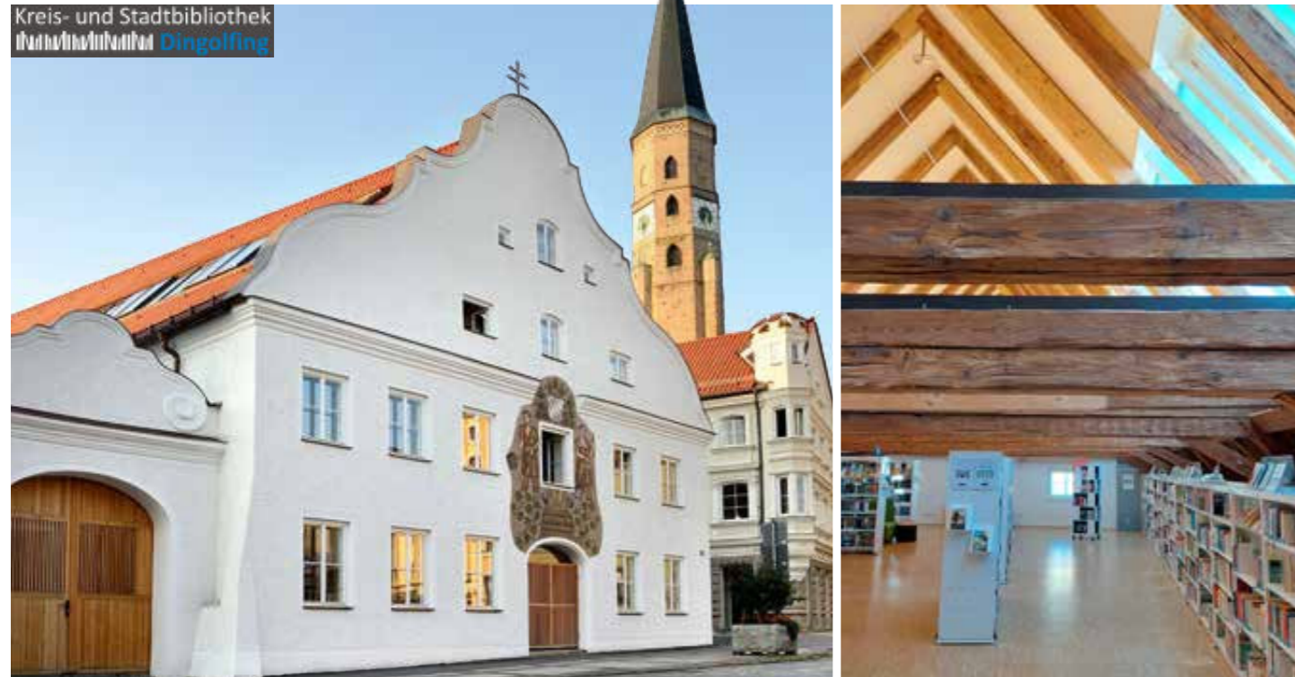
Kreis- und Stadtbibliothek Dingolfing

The large and modern district and city library is very centrally located on Marienplatz in Dingolfing. It is a public institution and is freely accessible to all and can be used on site. In addition, the City of Dingolfing provides all citizens who live in the city or the surrounding area with a free library card, which entitles them to borrow books. The 1,200 square metre library has over 33,000 items to borrow: Books, magazines, audio books, DVDs, console games, CDs and Tonies. Daily newspapers, such as the Dingolfinger Anzeiger or the Süddeutsche Zeitung, can also be read on site. Don't have time or don't feel like coming to the library? No problem! Use our online services from the comfort of your own home and around the clock.